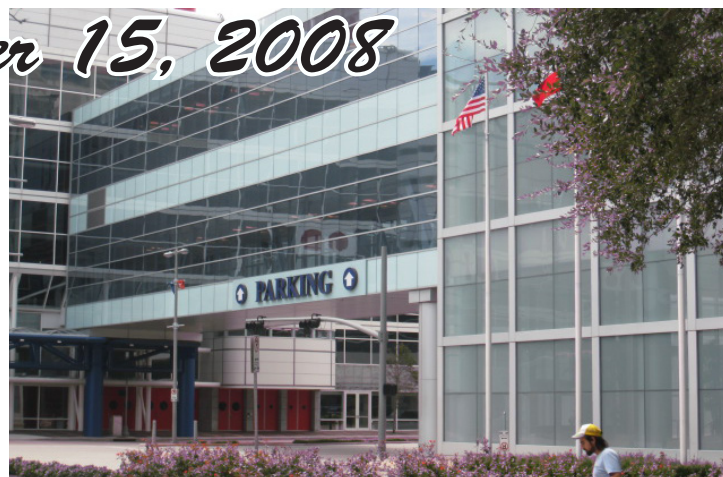
Skybridge from GRB to the Hilton