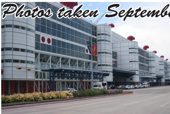
Street-level view of G. R. Brown