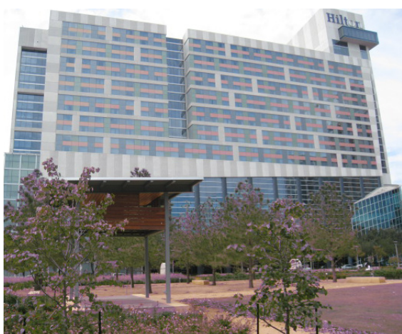
Hilton of the Americas